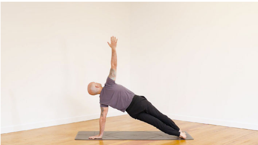
This is a great example of a well-framed shot; it depicts each item on our list.