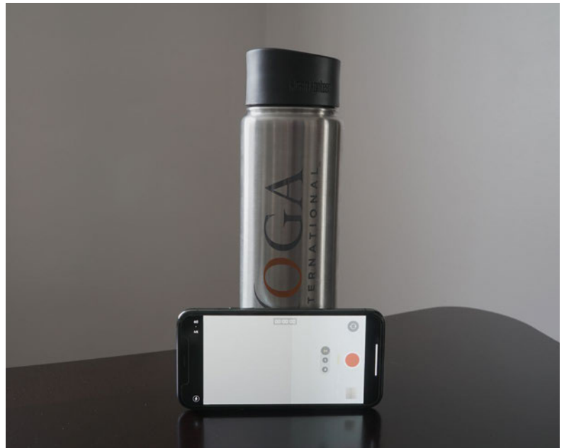
This is an ideal at-home set-up using a camera phone. This depicts the viewpoint of the person sitting behind the recording device.

*If using a camera phone, use the camera on the back, NOT selfie mode. The quality is much better!