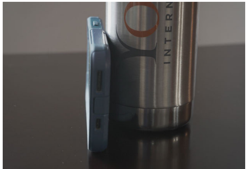
DO prop the camera phone against a hard, sturdy surface. Choose a set-up that allows the phone to be upright, not tilted.